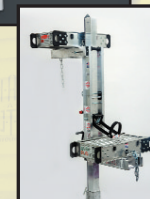
The Pro-Guide™ Roller System, and the Saf-T-Bracket™ are Patent Pending.